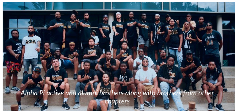
Alpha Pi active and alumni brothers along with brothers from other chapters

The annual Ice Breaker wrapped up with strolls from several brothers—Alpha Pi chapter brothers, Alpha Pi chapter alumni, and brothers from other chapters in and out of state.